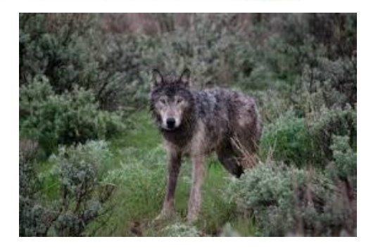
Report all wolf activity online at:

Take into account the substrate. Soft mud or melted snow may make the foot size appear larger than it really is. Attempt to record the actual outline by measuring the bottom of the track.